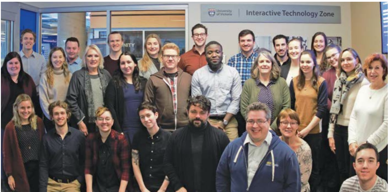
The CanAssist team develops innovative technologies and programs to fill gaps in existing services and supports.

Fee-for-service contracts and royalties also brought in revenue. CanAssist continues to develop our relationship with WorkSafeBC and fee-for-service revenue is increasing. With investments from the Province, we had the opportunity to produce broad-based technologies and develop private sector partnerships.